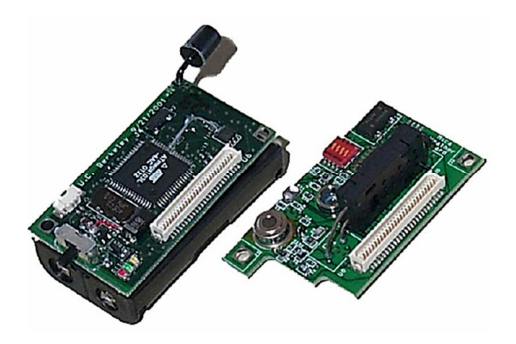
Fig. 2. Mica node.