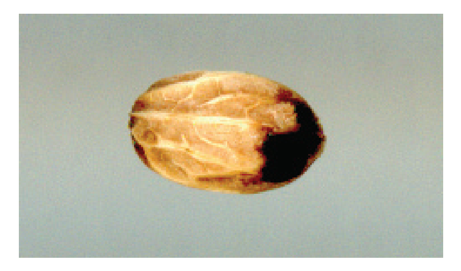
Figure 1: Example of different information (i.e. pixel intensities) conveyed by objects

value capable to separate background from the foreground.