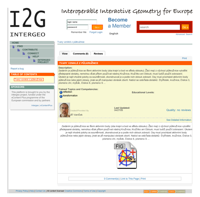
Fig. 1: A very simple resource, a Cabri construction, in Czech, and its annotations within I2Geo for an English speaking user.